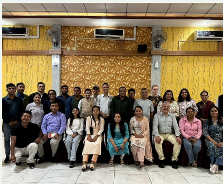
Participants of the inception workshop

SAPPROS Nepal also showcased its achievements in promoting balanced development through innovative agricultural approaches and social inclusion efforts. The event concluded with development of project plan and a collective commitment from stakeholders to ensure the success of the FAIDA project.