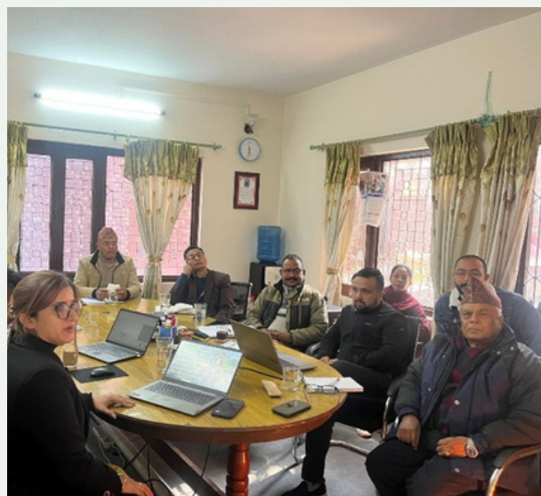
Meeting with representatives of the partner organization.

The Safal Project focuses on improving livelihoods by empowering communities with sustainable on farm, off-farm and skills-based economic opportunities along with the input support and initiatives for value chain development and market linkages. It also looks to promote voice and participation of women and marginalized groups through state and civic engagement by bolstering municipal capacities for participatory planning, transparent service delivery, and inclusive governance aligned with Nepal's federal structure. At its core, the project emphasizes localization, empowering local communities and governments to lead decision-making while aligning activities with local development.