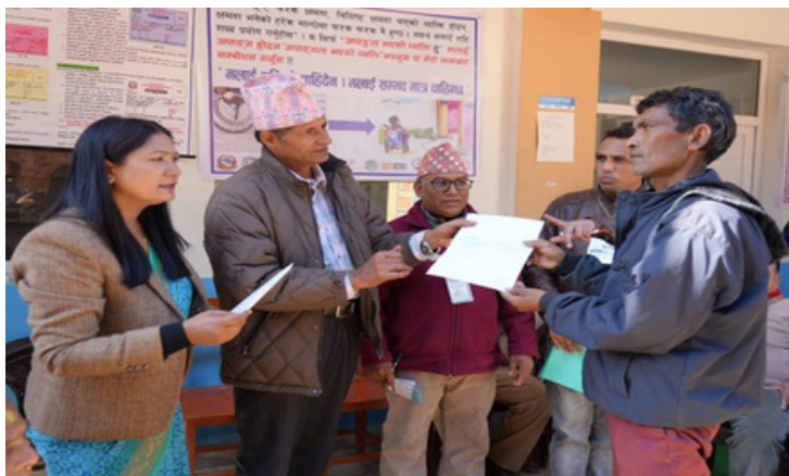
Financial assistance cheques handed Over to flood and landslide victims by the Mayor and Deputy Mayor of Chautara Sangachokgadhi Municipality, Sindhupalchwok district.

In late September 2024, relentless rainfall triggered severe flooding and landslides across Nepal, causing widespread devastation. In response, SAPPROS Nepal swiftly provided immediate relief in two of its project areas in Sindhupalchwok and Lalitpur districts. The affected communities faced critical shortages of essentials, including food, healthcare, education, and transportation. Recognizing the urgency of the situation, SAPPROS Nepal mobilized resources in close collaboration with local authorities to support the victims.